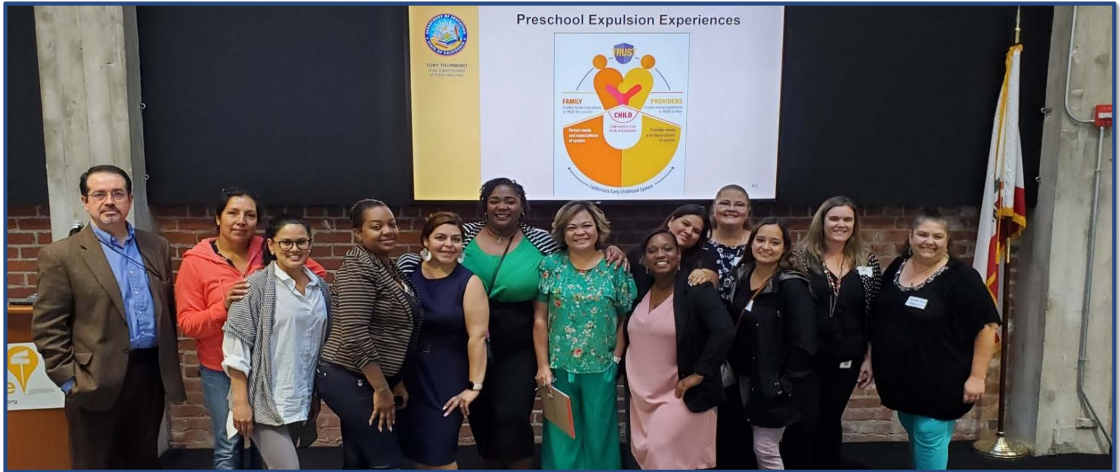
Preschool Development Grant Parent Committee and CDE staff